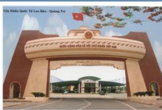
Laobao border checkpoint (Vietnam)