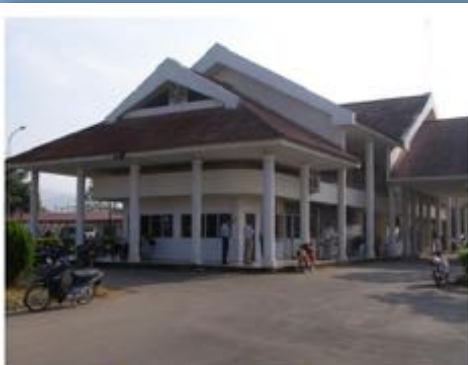
Dansavanh border checkpoint (Laos)